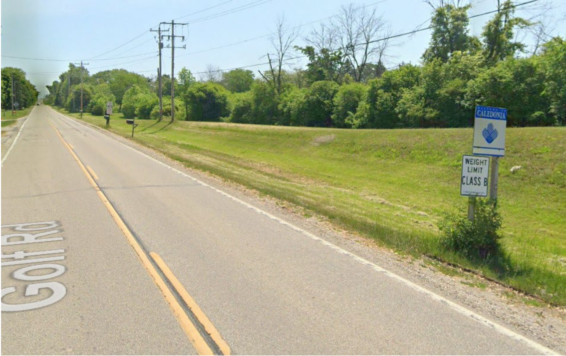
Erie Street – South Village Limits