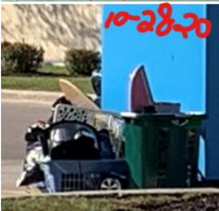
A of Violation Notice will be sent to the owner.