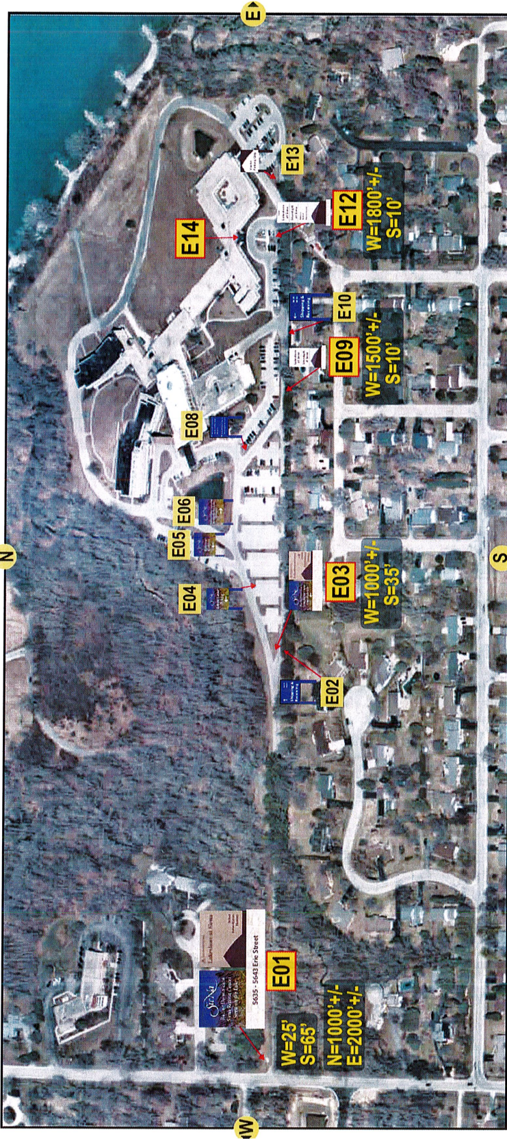
Sign Locations and Setbacks