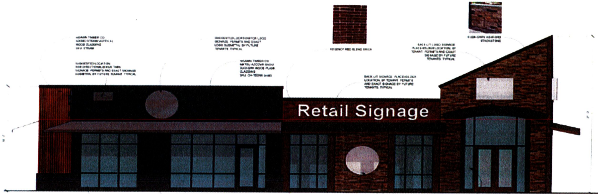
2 WEST ELEVATION