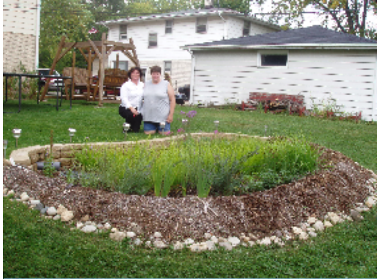
Robin Latus, Hales Corners, 120 sq. ft., built 2009

Runoff into streets and nutrients in stormwater runoff have been identified as major threats to the health of local ecosystems, including the Root River, Pike River and Creek, Des Plaines River, S.E. Fox River and near shore Lake Michigan. According to EPA, polluted runoff contributes 90 percent of pollution in our streams, rivers and lakes. Some behaviors contributing to stormwater runoff and nutrient oversupply include: lack of permeable land surfaces, over-