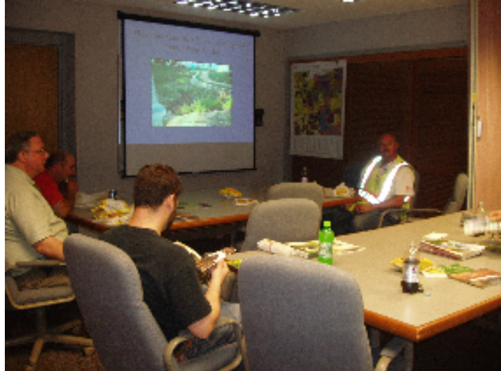
Training session for City of Franklin public works employees prior their excavation of a rain garden, June 2010.

The March 2011 presentation will feature an expert on agricultural runoff , possibly from NRCS, to explain the programs and activities underway intended to reduce the impact.